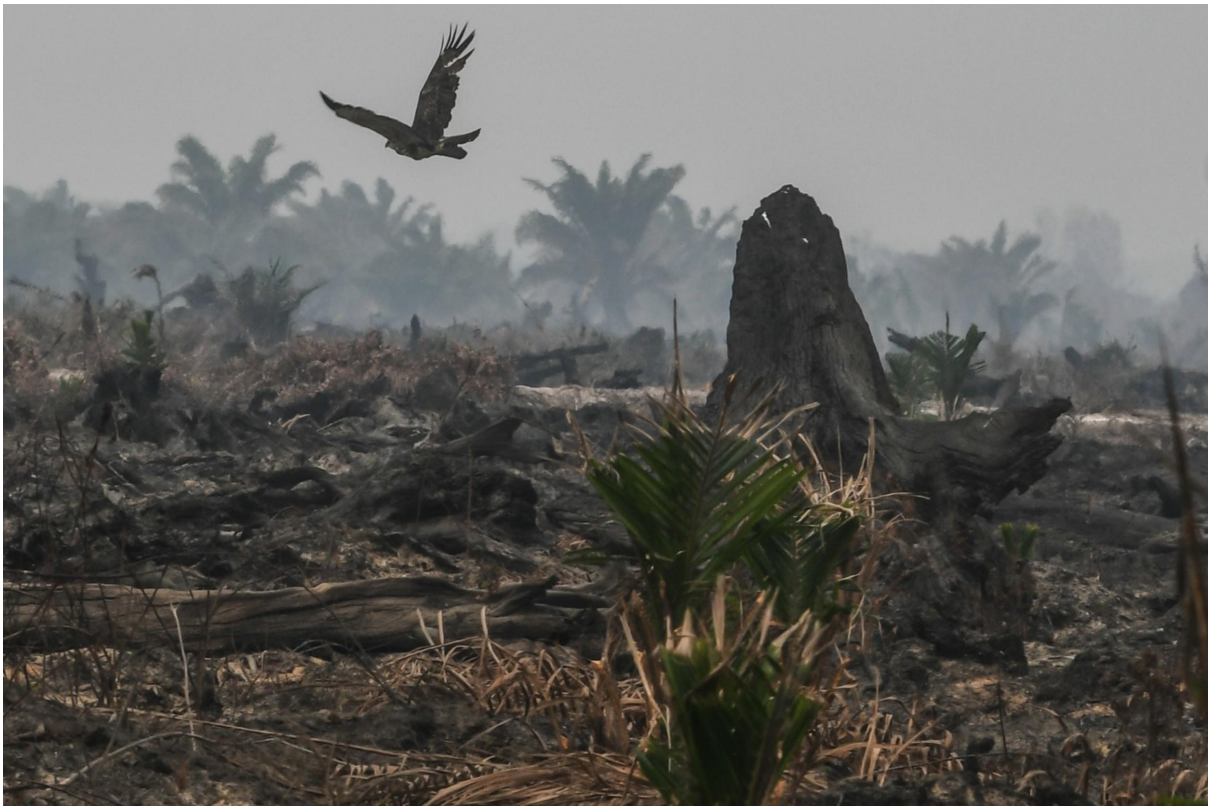
22 September 2019, PT Dyera Hutani Lestari, Jambi: An eagle ( Nisaetus cirrhatus ) flies over burned peatland.