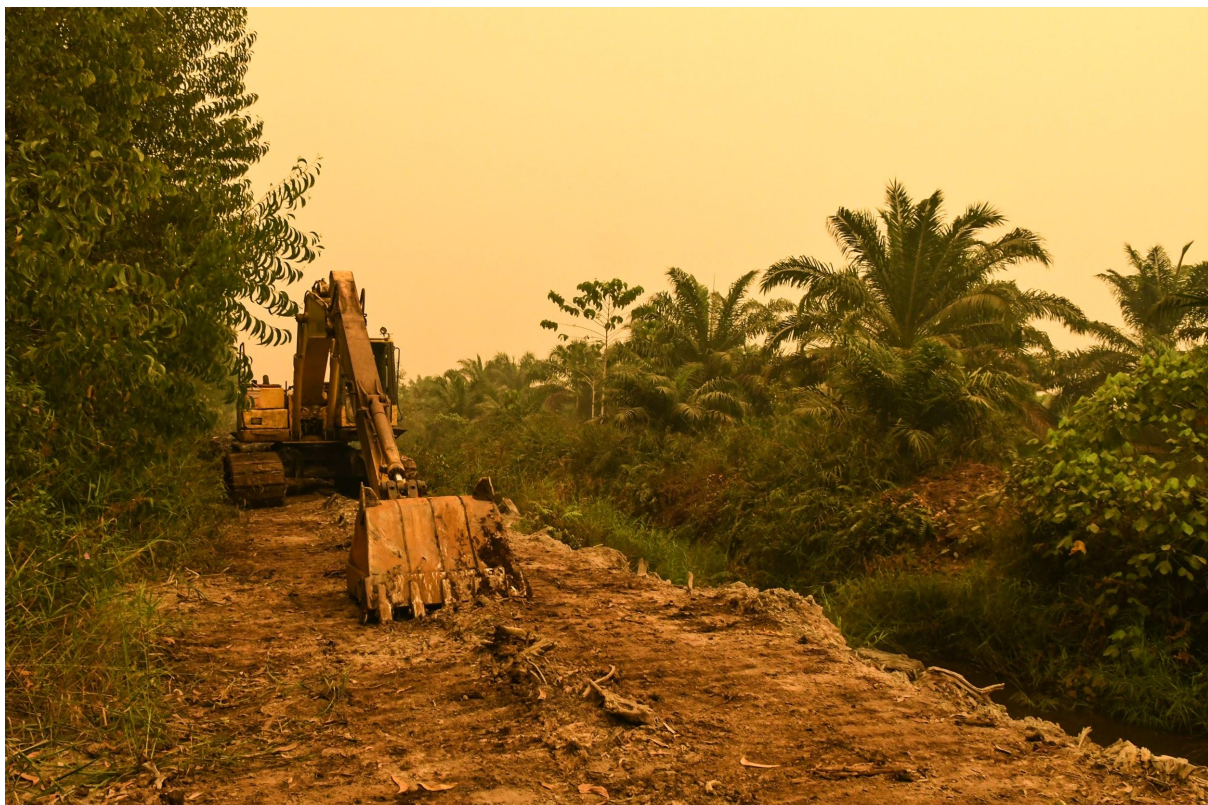
21 September 2019, PT Kaswari Unggul, 1°17'50.699" S 103°45'41.92" E: An excavator at work in the haze from peatland fires in the PT Bukit Barisan Indah Prima concession in Jambi. The plantation company is currently facing civil court action. PT Kaswari Unggul is named as a supplier to Unilever, Mondelēz, Nestlé and Procter & Gamble as well as Wilmar, GAR and Cargill.

Alan Jope, Unilever CEO, UN Climate Action Summit on 23 September 2019