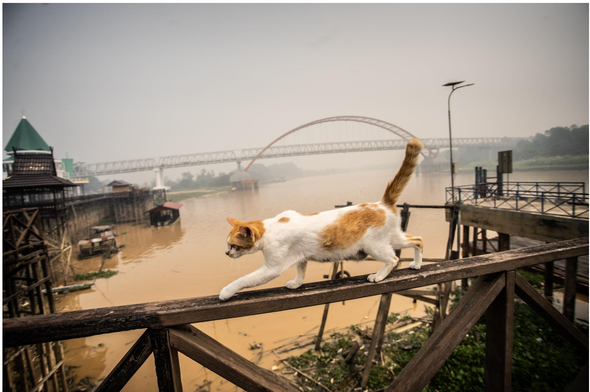
23 September 2019, Palangkaraya, Central Kalimantan.