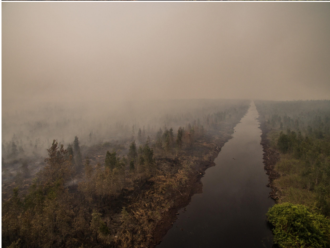
12 September 2019, PT Globalindo Agung Lestari, PT 2°29'7.12" S 114°34'46.03" E and 2°29'21.829" S 114°34'40.6" E: Drone footage of smoke rising from burning peatland forest over a drainage canal inside an oil palm concession owned by the Malaysian company Genting Plantations Berhad that has been sealed by the KLHK for investigation. All of the consumer companies and traders reviewed for this report are supplied by Genting.