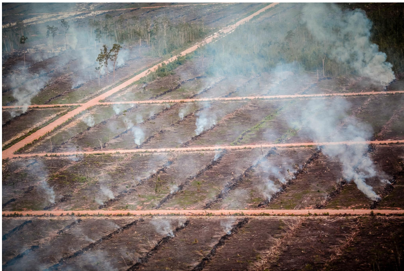
26 March 2013, PT Dongin Prabhawa, 7°20'9.79"S 139°45'30.946"E: Smoke rises from long rows of smouldering debris from forest clearance in Korindo's PT Dongin Prabhawa oil palm concession in Papua. Such woodrows and the proliferation of fires within them are strong indicators of deliberate use of fire. Nestlé's and Unilever's supply chain disclosures continue to show exposure to Korindo.

The burn scar area figures in this report have all been calculated based on the government's burn scar data. While satellite imagery suggests the government map may meaningfully overestimate burning in Korindo's concessions, Greenpeace's calculations have not been altered, for reasons of methodological consistency. Further, despite Korindo's assertions, the evidence remains that there has been extensive burning within Korindo concessions, with strong indications of deliberate use of fire.