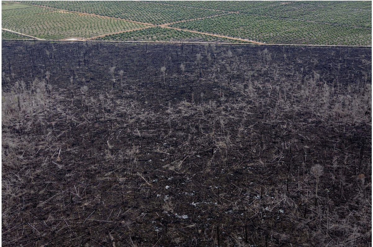
3 December 2015, PT Arrtu Energi Resources, 1°43'53.999" S 110°14'33" E": Burnt remains of forest following recent fires inside an oil palm concession owned by Rajawali/Eagle High in West Kalimantan. Visible in the background is an oil palm plantation operated by a different company, seemingly not impacted by the fires. All of the consumer companies and traders reviewed for this report are supplied by Rajawali/Eagle High.