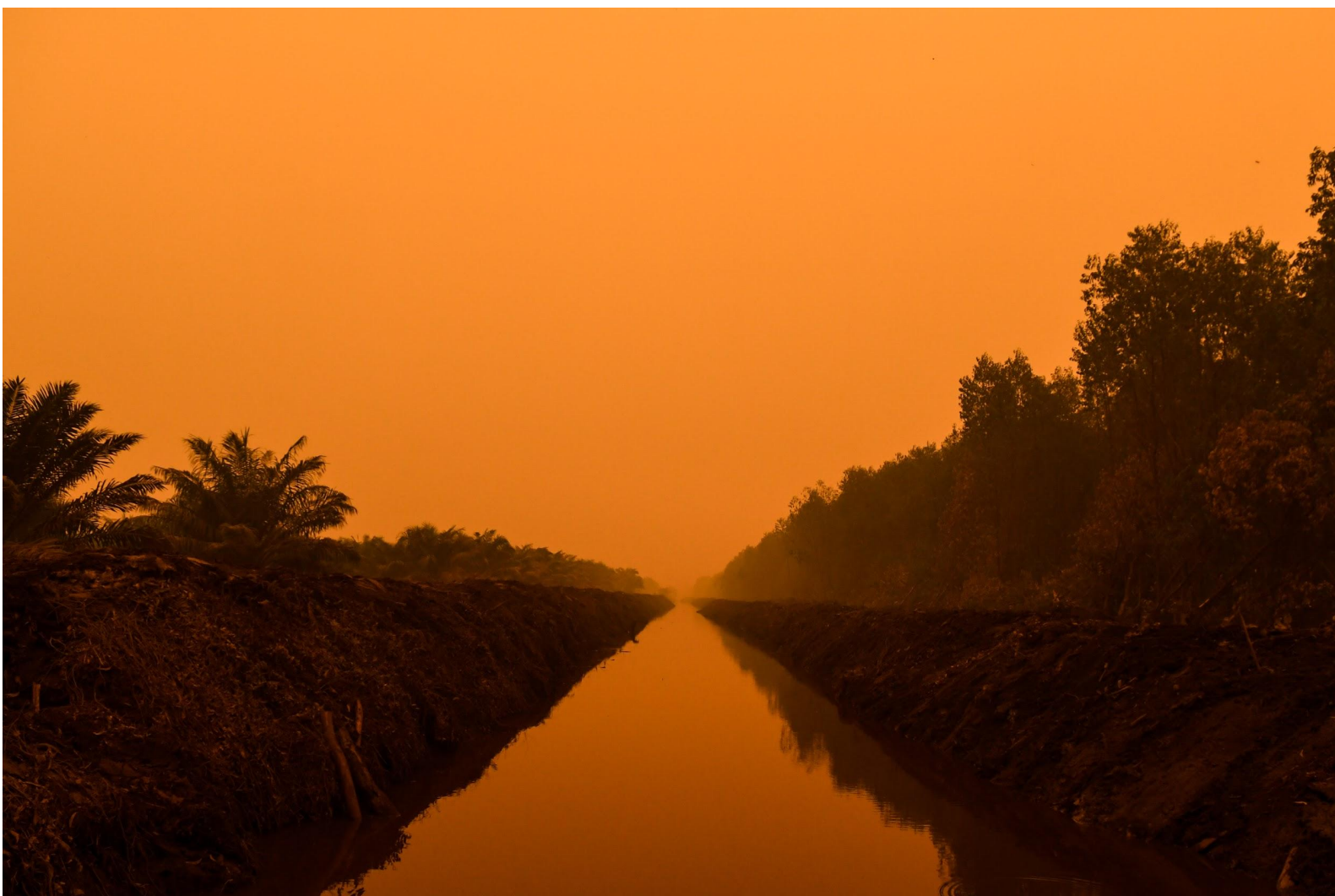
21 September 2019, PT Wira Karya Sakti, 1°19'3.979" S 103°45'30.499" E: A thick red haze surrounds a canal in burned peatland in a Sinar Mas Forestry pulpwood concession in Jambi.