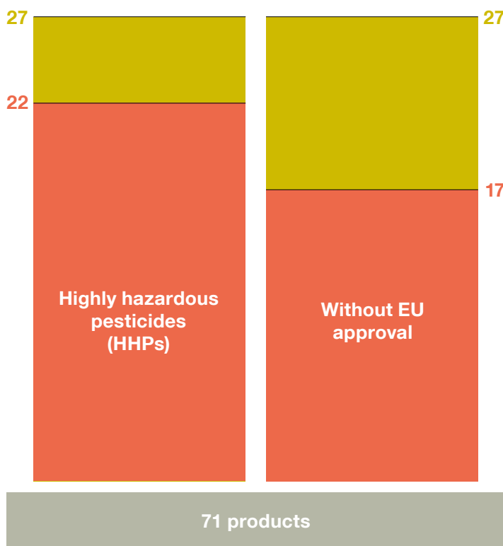
Figure 3: BAYER Crop Science pesticides and active ingredients that have been approved in Brazil (as of February 2020)

Among them are active ingredients such as Imidacloprid and Chlorpyrifos, which are not allowed to be used in open spaces or whose approval application was rejected in the EU due to the great risk they pose to humans and the environment (see Box 2).