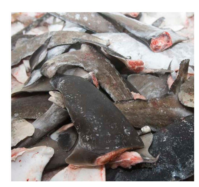
Shark fins onboard a Taiwanese vessel in the Pacific Ocean