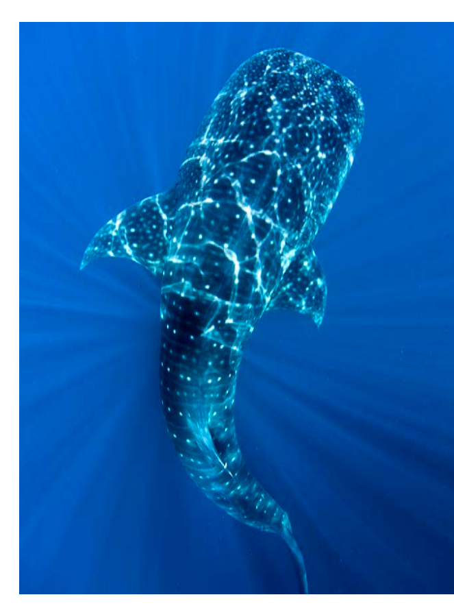
Whale shark