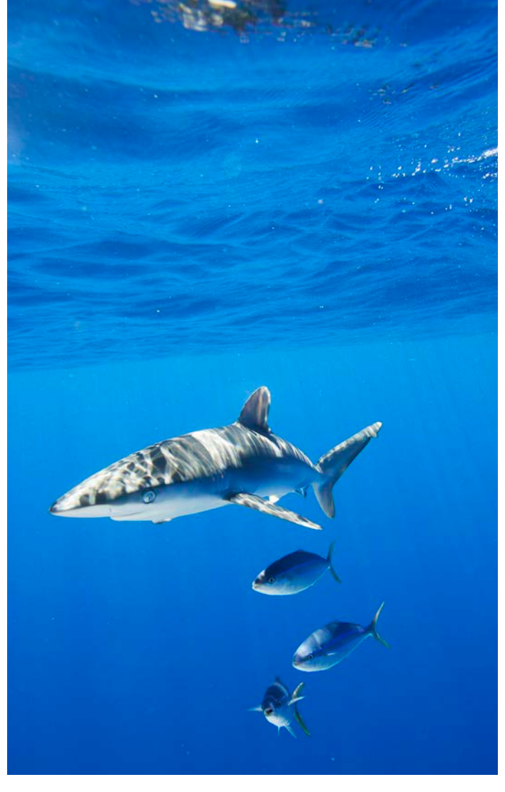
Shark in the Pacific Ocean

The case in the ICCAT Convention Area is unfortunately representative of what happens under the purview of practically every single RFMO. Complex and ecologically important species like blue shark require coordinated efforts to protect breeding grounds and migration routes across vast areas. A Global Ocean Treaty could ensure that such an oversight in governance would be filled for important species like these that are currently falling through the gaps, including through the designation of fully protected marine protected areas. In one study of nearly 90 marine protected areas with varying degrees of protection, fourteen times more sharks were found inside effectively protected areas than in unprotected areas.26 Sharks play a vital role in oceanic ecosystems, and have been part of them for an estimated 450 million years. Whilst they display a great diversity of species, the large predator role they play is especially important in maintaining healthy marine life communities. In instances where large sharks have been fished out, often unexpected trophic changes have taken place – leading to further imbalanced ecosystems with lesser predators unchecked. Examples of this include the increase in cow-nosed rays in seas off