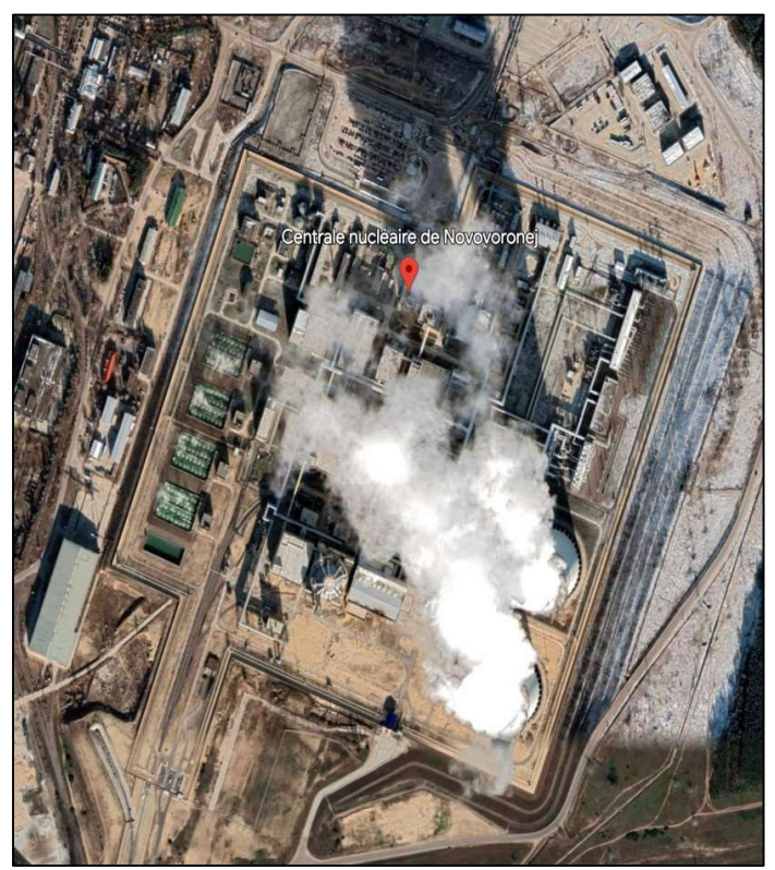
Novovoronezh nuclear plant, Voronezh Oblast, central Russia

It is important to understand these time frames in the context of current Framatome/Siemens contracts with Rosatom. Records show, for example, that the AREVA-Siemens I&C project at the new build construction at Novovoronezh II-1 lasted for 5 years (beginning one year after the start of construction in June 2008, and ending over a year before the reactor began operation in 2016).<sup>54</sup> For the second project at Novovoronezh II-2, the AREVA-Siemens project lasted two years (beginning five years after start of construction in 2009, and ending over two years before the reactor was connected to the grid in May 2019).<sup>55</sup> In other words, the recent agreement between Framatome/Siemens and Rosatom could see the French and German companies actively working on Rosatom nuclear power plants in Russia and overseas for many years to come.