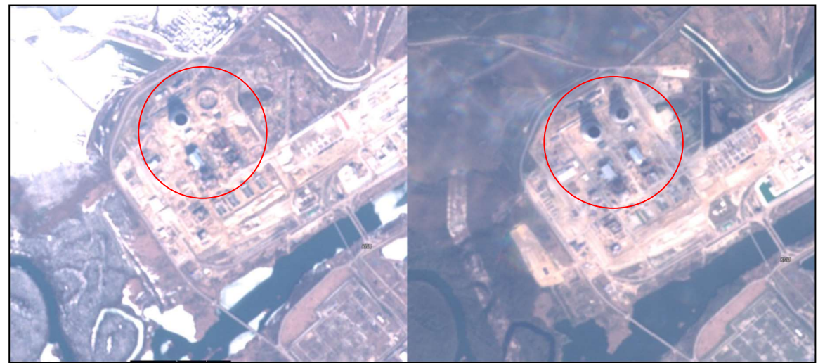
Images of construction phases of KURSK II, two VVER-TOI 1200 MW reactors under construction in western Russia. Framatome is contracted to supply and install TELEPERM I&C systems. The satellite image from June 2021 (top) shows multiple heavy lift cranes at KURSK II unit 1. The March 2022 image (left) shows one of the main auxiliary buildings still under construction, whereas by April 2023 (right) both cooling towers and external auxiliary buildings are completed.