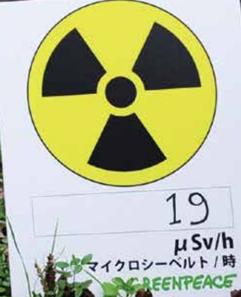
Image: A Greenpeace sign indicates a radioactive hot spot in a storm water drain between houses in Watari, approximately 60km from the Fukushima Daiichi

The current nuclear liability conventions are intended to protect the nuclear industry, and do not offer sufficient compensation to victims.