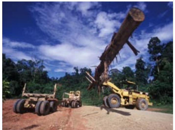
In Indonesia it is estimated that up to 90% of logging is illegal.

Muhammed Prakosa, Indonesian Forest Minister, January 2003.