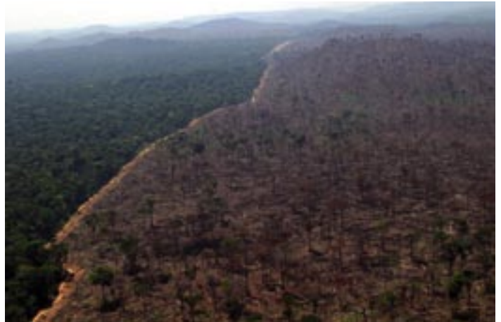
In just one year the Amazon lost an area almost the size of Belgium to rainforest destruction.

Ancient forests stabilise the structure of the soil, helping to prevent erosion, silting of rivers and flooding. In mountainous areas they also reduce the risk of landslides. Furthermore, forests serve as vast carbon reservoirs, storing carbon dioxide and playing an important role in the regulation of the Earth's climate.