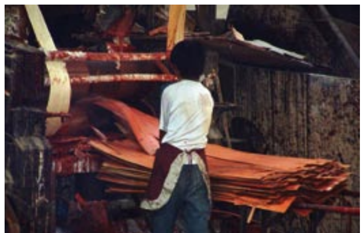
Plywood mill in China supplying timber to the EU.