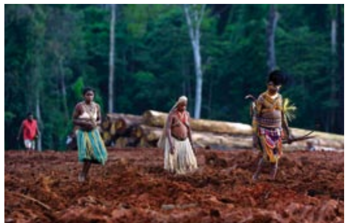
Illegal logging in Papua New Guinea destroys the homes of indigenous peoples who depend on the forest.

Minister Trutnev, Russian Minister for Natural Resources, October 2006. 7