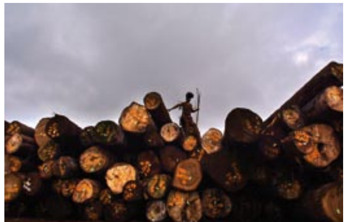
Landowner Sakas Aonomo on a stockpile of logs in PNG. His family faces an uncertain future as logging threatens to destroy their lands.