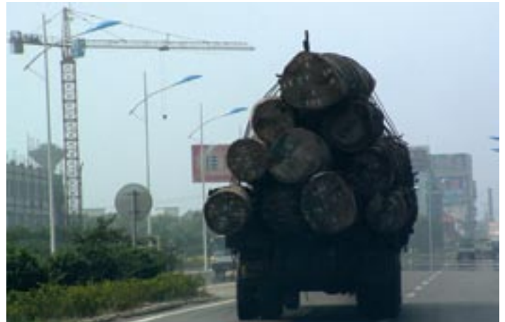
A truck loaded with African logs heads for processing into plywood in China.

EU Parliamentary Industry and Trade Committee, January 2004.