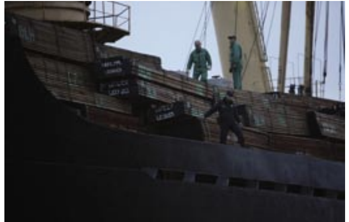
There is currently no law to stop the import of illegally logged timber into Europe.