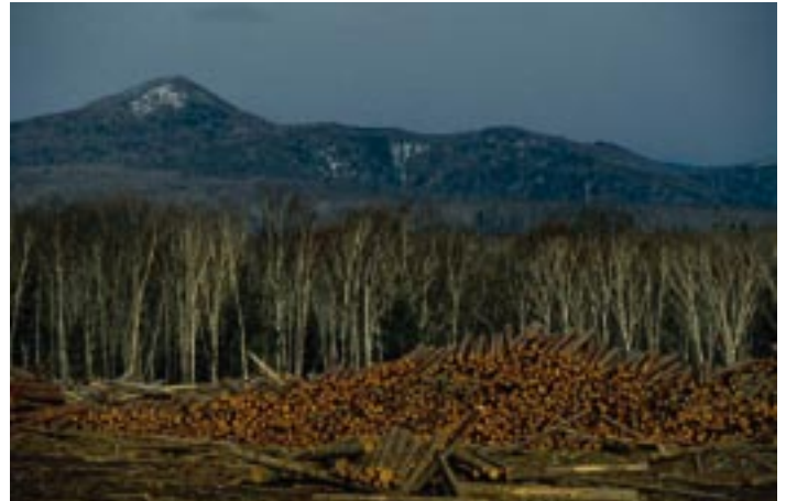
Logging in Russia is destroying ancient boreal forest

To address the problem of illegal logging, the European Commission adopted an Action Plan on Forest Law Enforcement, Governance and Trade (FLEGT) in May 2003. Amongst other things, the Action Plan recommends the development of Voluntary Partnership Agreements (VPAs) with timber producing countries which are aimed firstly at helping these signatory countries improve their governance and forest management and secondly, implementing a licensing system to ensure that they only export legal timber to Europe.