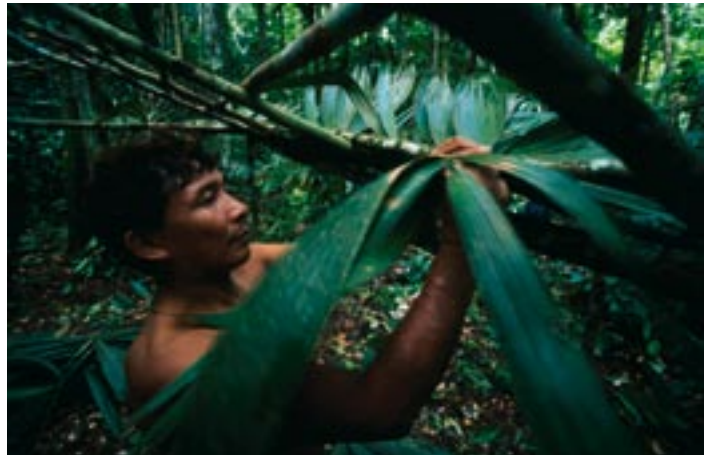
Ancient forests are critical to indigenous peoples who depend on them for their way of life